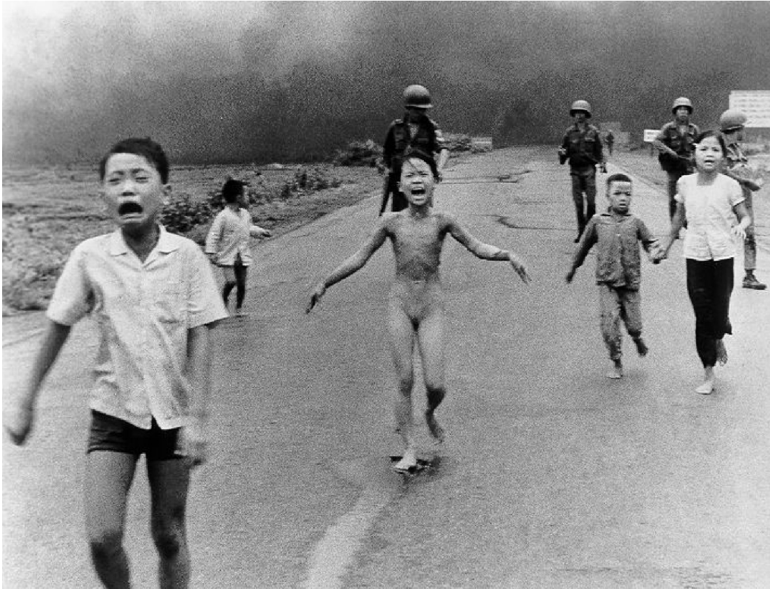
A photograph by Nick Ut, an Associated Press photographer, June 8, 1972. It shows children, followed by South Vietnamese troops, on a road near Trang Bang following an aerial napalm attack on suspected Viet Cong hiding places.