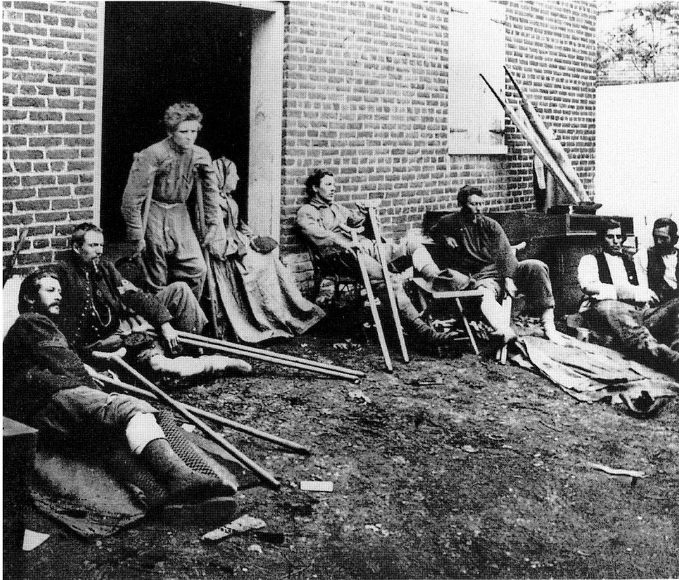
A photograph of Union soldiers wounded at the Battle of Fredericksburg, December 1862. The photograph was actually taken in May 1863.